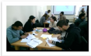
Workshop Animation ANSEJ. BLIDA